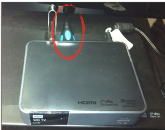
Western Digital (WD) HDMI Cable