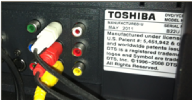
Toshiba VCR cables